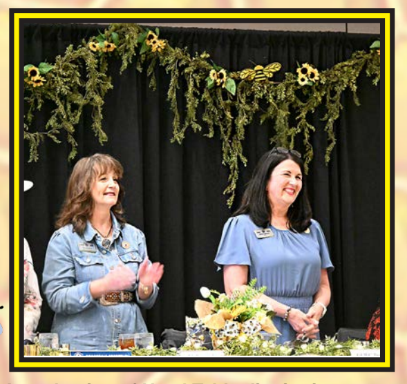
Introduction of Head Table dignitaries.