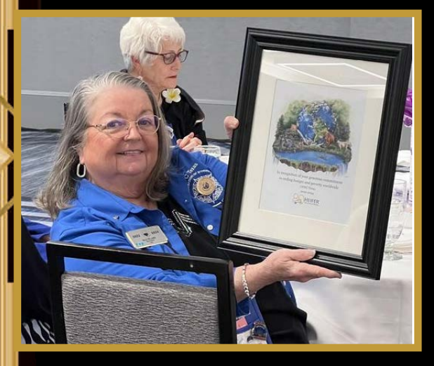
Heifer International recognized GFWC Texas for its' contributions to their organization.